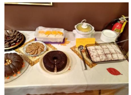
..but the dessert was BETTER