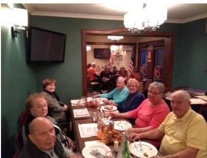
The Oktoberfest food and camaraderie was great!!!