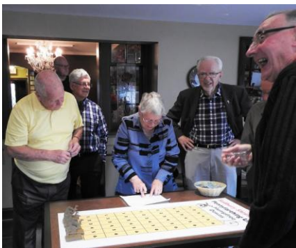
They're at the post.....