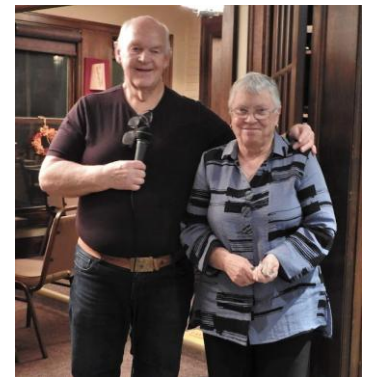
..and the dromedary diva winner is.. Lady Norma