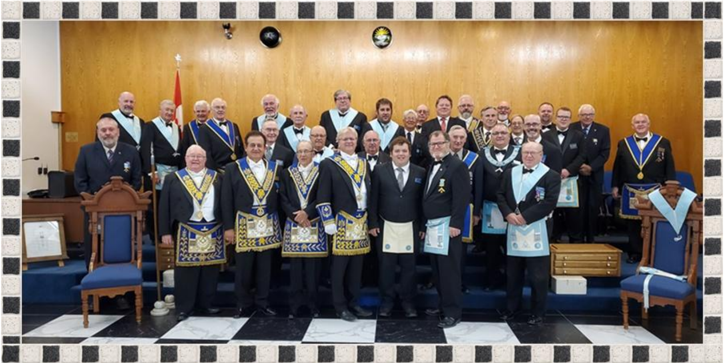
Bethel Lodge No. 699 – Official Visit of the D.D.D.M.