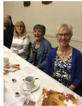
The October Meeting was held in Little Current – Thank you Haweater Unit!!