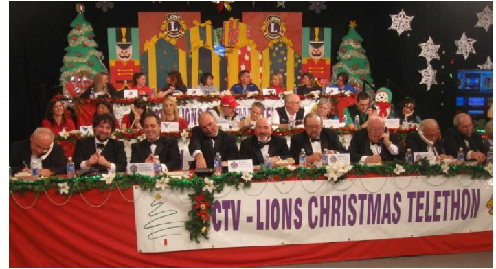
A cheque presentation was also made during the event.

On the 7th of December several Freemason's from the Sudbury Manitoulin District answered telephones during the annual CTV/Lion's Children's Christmas Telethon.