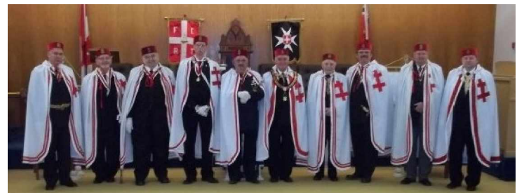
Doric Lodge announces the start of Java Manitoulin on the last Thursday of the month.

Knights Templar Mavar Preceptory welcomes the P.G.P. on his Official Visit.