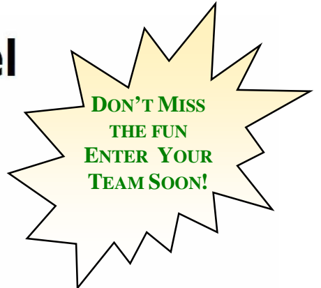
Enjoy 3 games of curling, a roast beef dinner, prizes and lots of FUN!!!

Hosted by: Espanola Masons February 15<sup>th</sup>, 2014