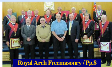
Royal Arch Freemasonry / Pg.8