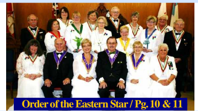
Order of the Eastern Star / Pg. 10 & 11

A Special Invitation to Veterans / Pg. 3