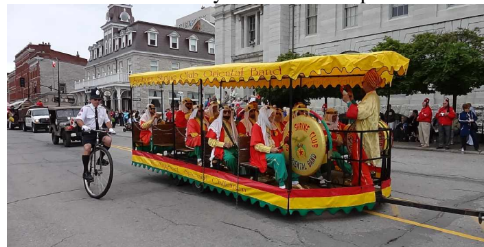
2013 Spring Ceremonial in Kingston