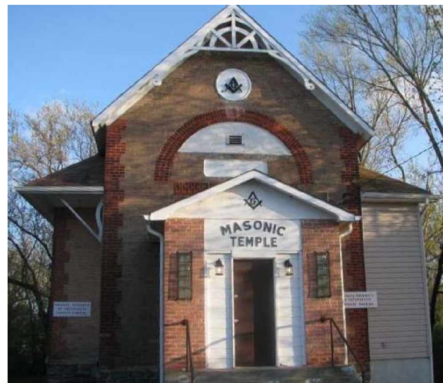
Sturgeon Falls Lodge No. 447