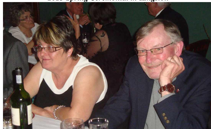
The Shrine Club's annual Evening on Elm Street offers Shriners and their Ladies an evening of fine gourmet dining with romantic charm.

The Oriental Band and Colour Party are celebrating their 50 th Anniversary with a gathering at the annual Ladies night, Friday, October 18 th at the Howard Johnson