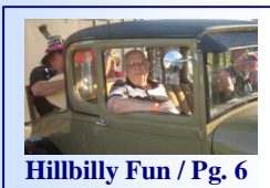
Hillbilly Fun / Pg. 6

Congratulations & Best Wishes / Pgs. 4, 5, 6