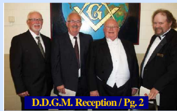
D.D.G.M. Reception / Pg. 2