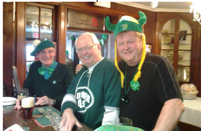
Annual St. Patrick's Day party hosted by the Hillbillies Spring Ceremonials occur throughout the Rameses Shriners of Toronto jurisdiction enabling Shriners and their ladies to visit many location in the province.

Through the fundraising work of Shriners and Shrine Ladies we continue to support the assistance the Shriners Hospital network provides to children with severe burns and disabilities. Many of these activities involve fun and fellowship.