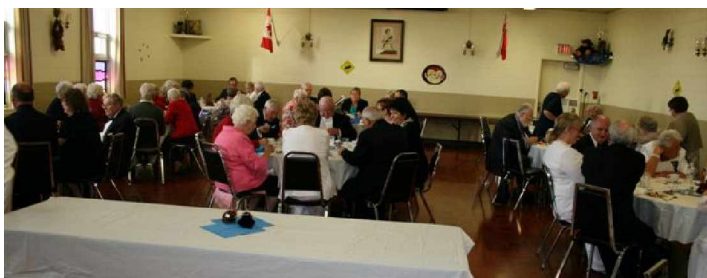
Members of Algoma Chapter and Friends enjoy dinner compliments of Algoma Chapter after Installation 2013