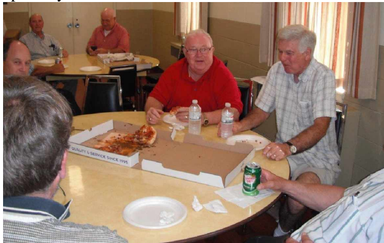
The clean-up crew can be seen enjoying a pizza and cold drinks (and conversation "of course") compliments of Java Guild.

Volunteers were required for a major yard and area clean-up at Belrock. Over the summer months two parking lots were cleaned, many trees were trimmed, many weeds were pulled, and many bags of garbage were picked up. They even weed-wacked and raked the lawn.