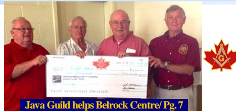
Java Guild helps Belrock Centre/ Pg. 7