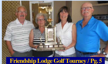
Friendship Lodge Golf Tourney / Pg. 5