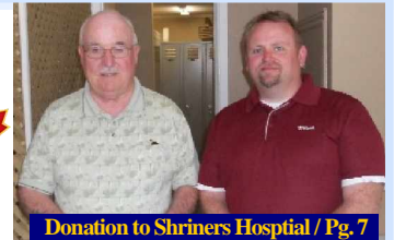
Donation to Shriners Hospital / Pg. 7