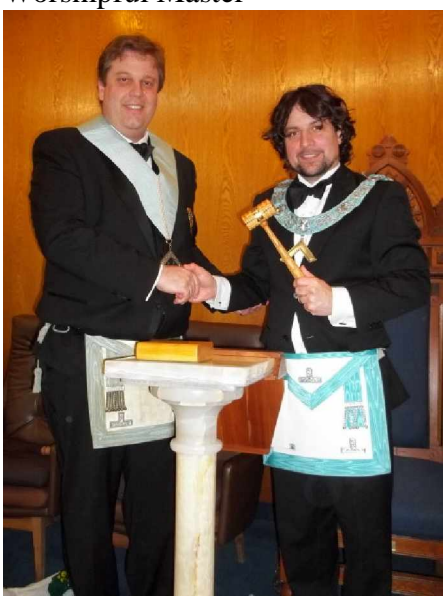
Presentation of Grand Lodge certificate