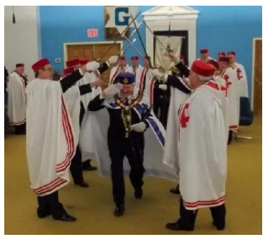
Received under the Knights Arch of Steel