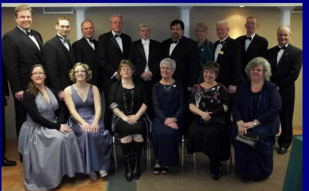
The Grand Master and Wendy met the district Masters and their ladies before the evening started