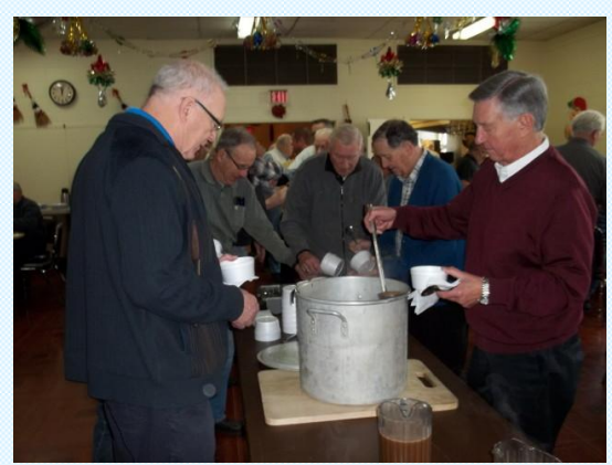
Lunch is now served!