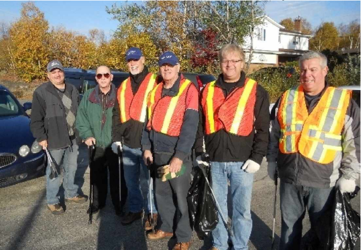
October 13<sup>th</sup> 2012 Friendship Lodge members held their fall cleanup on Long Lake Road for the city adopt a road program.