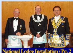
National Lodge Installation / Pg. 2