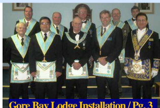
Gore Bay Lodge Installation / Pg. 3