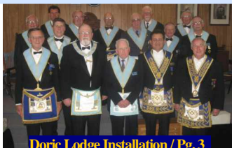
Doric Lodge Installation / Pg. 3