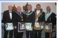
Algoma East District News / Pg. 5