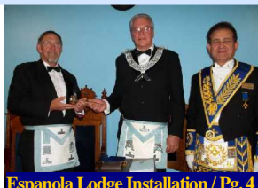
Espanola Lodge Installation / Pg. 4