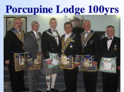
Temiskaming District News / Pg. 5

Congratulations & Best Wishes / Pgs. 6 & 7