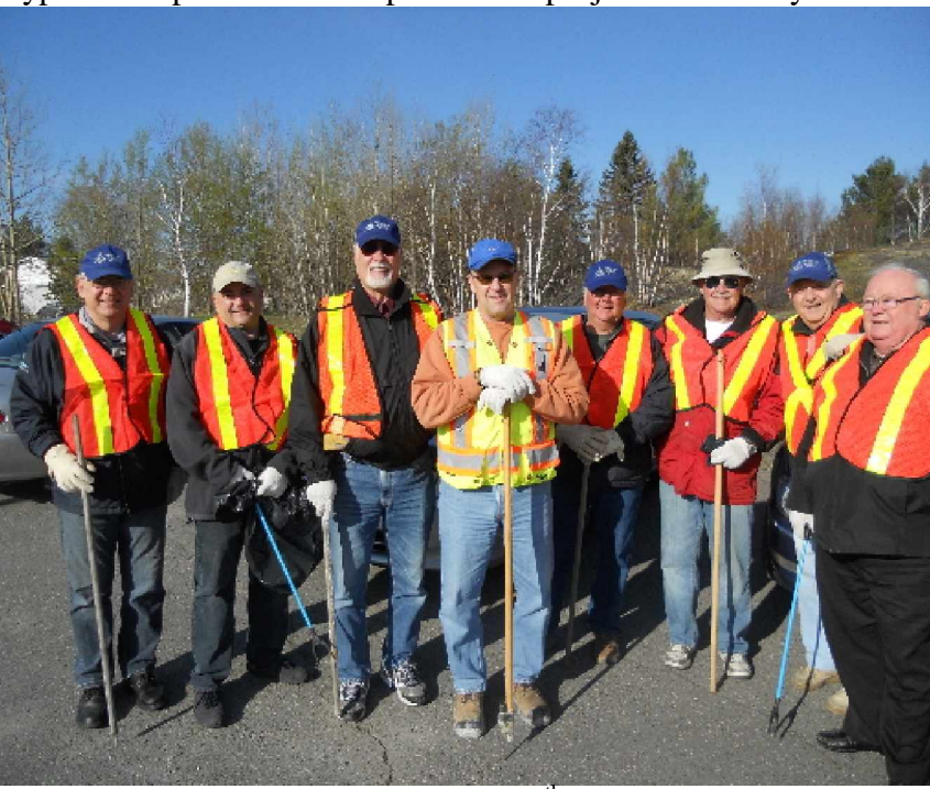
It is a beautiful sunny day on May 5<sup>th</sup> 2012 as the brethren are geared up and ready for a fun morning.

For the past 15 years the brethren of Friendship Lodge No. 691 have donned their working clothes and safety equipment to clean a section of Long Lake Rd. from Esther St. to the Southwest Bypass as a part of the Adopt-A-Road project in Sudbury.