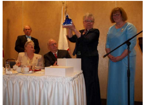
Figurine from Algoma Chapter presented to the DDGM.