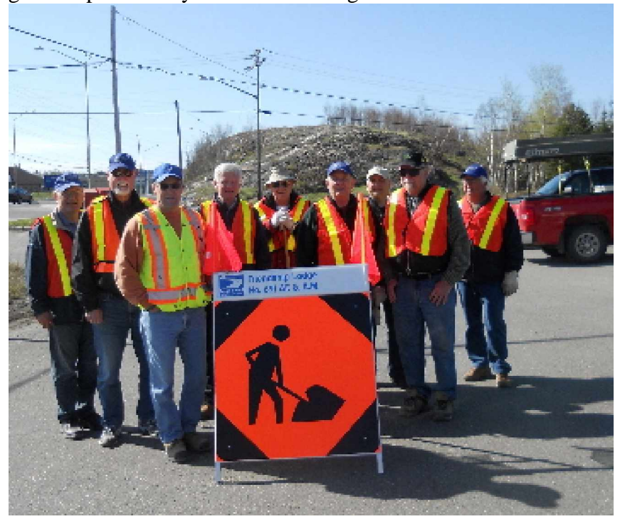
Safety is important when working on the highways and the brethren make sure proper signage is in place and protective clothing worn.