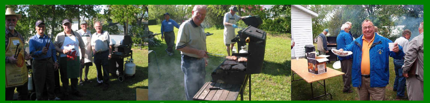
AFTER SUPPER STAY FOR THE ANNUAL DISTRICT MEETING AND LEARN WHO IS PLANNING TO RUN FOR THE OFFICE OF DISTRICT DEPUTY GRAND MASTER.