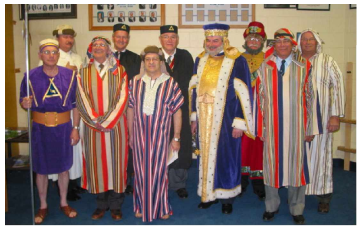
Degree Cast from North Bay prepare to enter the lodge room.

Take your next step in Freemasonry, you might be surprised to find out who is a Scottish Rite Mason.