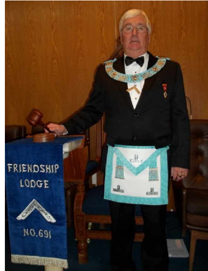
The new Worshipful Master ready to take on the Work.