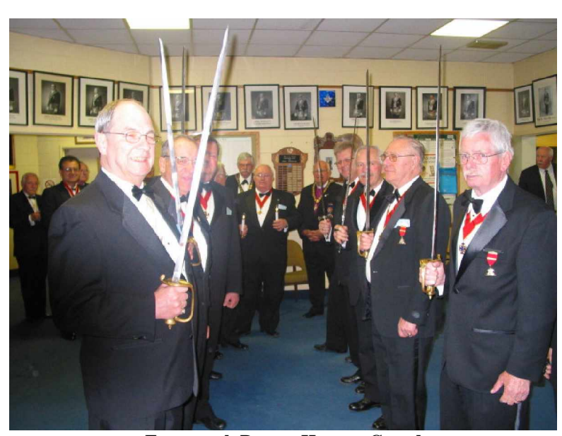
Fourteenth Degree Honour Guard