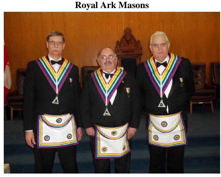
Nipissing Lodge No. 20 R.A.M. held their Installation