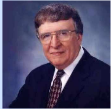
Sixty Years in Freemasonry. / Pg. 3