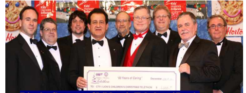
District Supports Children's Telethon / Pg. 6