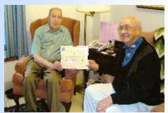
Sixty Years in Freemasonry / Pg. 4