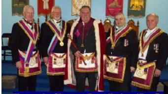
Espanola Chapter Installation / Pg. 5