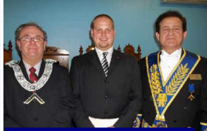
Espanola Lodge Official Visit / Pg. 2