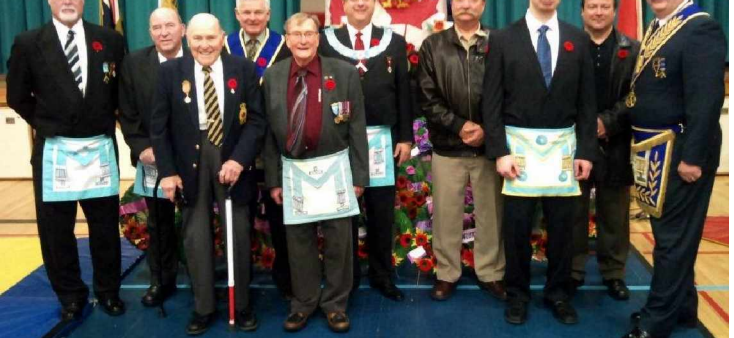
Remembrance Day services in Copper Cliff and at Sudbury Arena