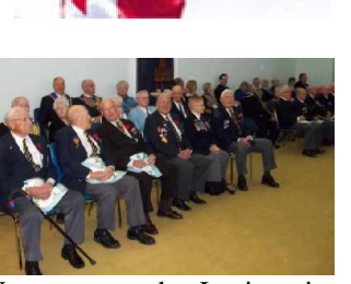
Veterans and Legionaries lined both sides of the lodge room