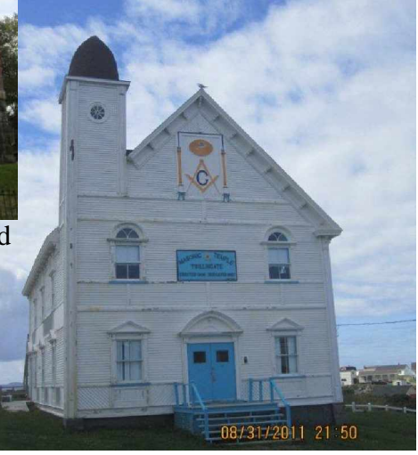
Masonic Building Twillingate, Newfoundland

If you have pictures you would like to share with the Sudbury-Manitoulin District newsletter please sent them to the editor atburns@persona.ca