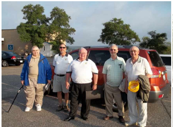
A beautiful day for a trip to Toronto