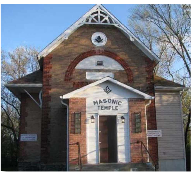
Sturgeon Falls Lodge No. 447