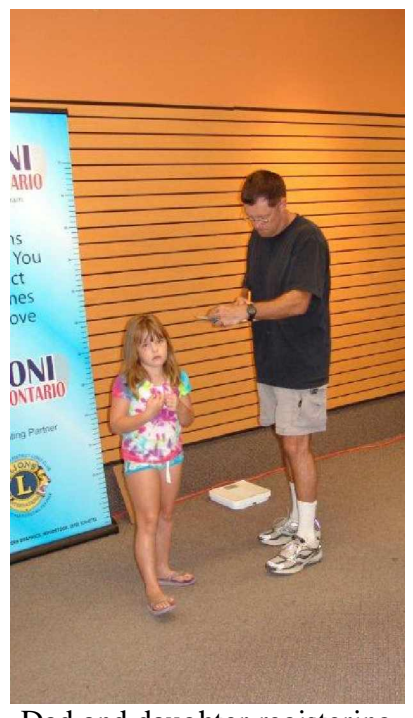
Dad and daughter registering