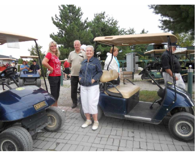
All set for the back nine