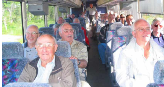
Join us for the ride to Grand Lodge and support our candidates.