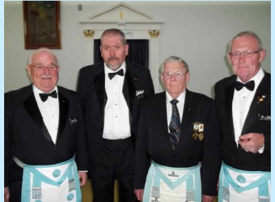
Visiting Masters Present