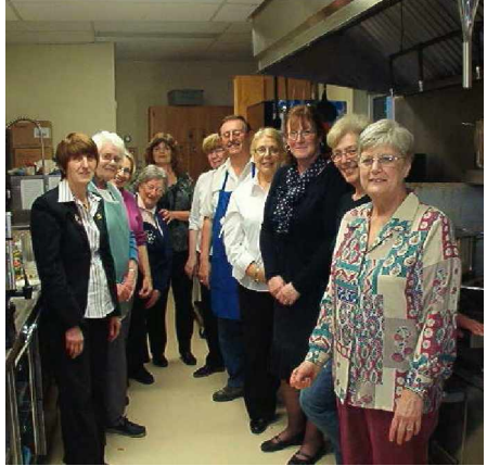
Members of the Order of the Eastern Star catered a fabulous dinner that featured roast beef and the traditional roast lamb