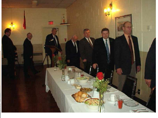
A Special Thank You