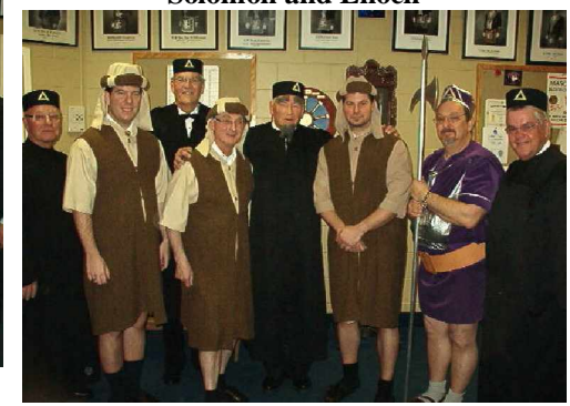
Class of 2011