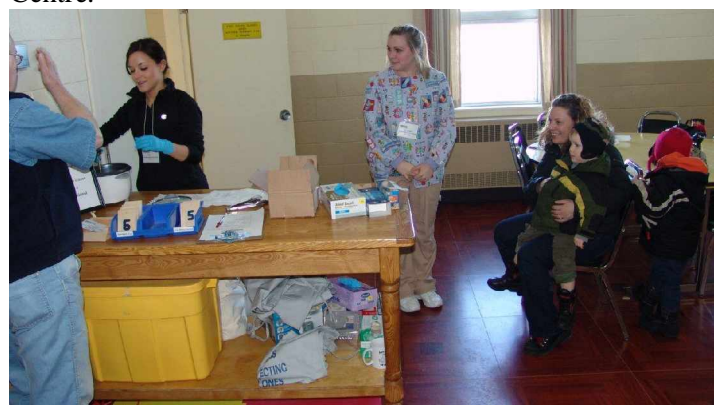
Four Cambrian College dental students were on hand to help make the dental impressions.