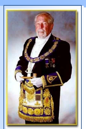
Invitation to Grand Master's Reception/Pg.2