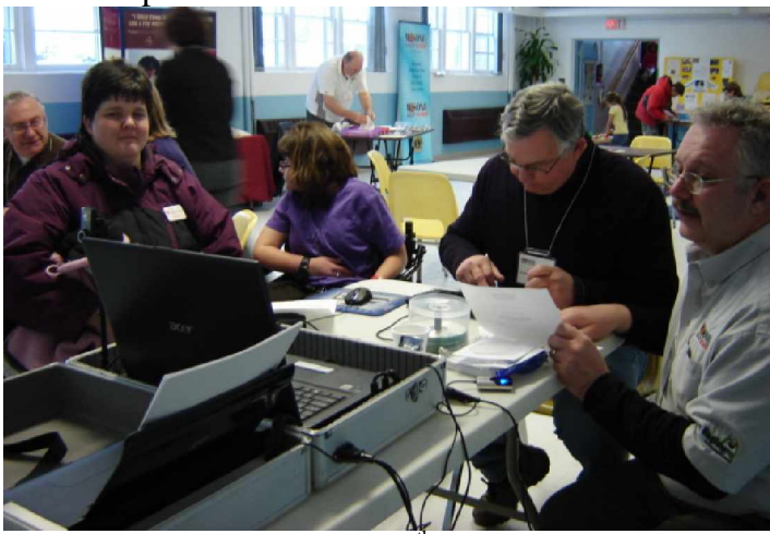
Then on Saturday, February 19<sup>th</sup> 2011 another 24 children were identified at a clinic held at the Belrock Masonic Centre.

Two MasonCh.I.P. Child Identification Clinics were held in February. On February 9<sup>th</sup> 2011 a clinic was held on Manitoulin Island during the Winter Fun Fair where 20 parents received kits on their children.