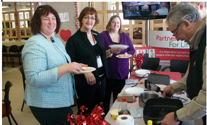
Staff and volunteers enjoyed the heart shaped pancakes made up by the Masonic chefs