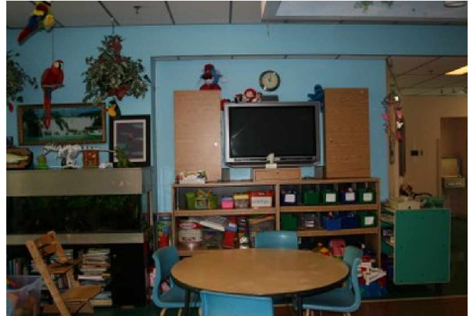
Bright colours and plenty of visual stimulus for the younger child