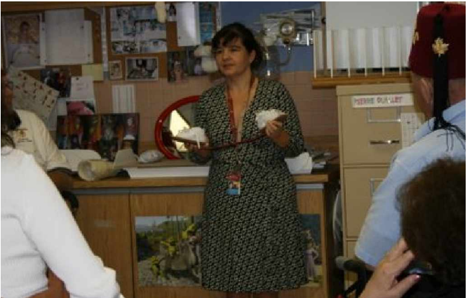
Tour of treatment facilities

The group got to see first hand the various orthopaedic braces and treatments available to children at no cost.