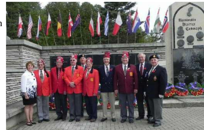
Brethren and Nobles assemble in front of the Cenotaph

In conclusion, I'd like to say a few words about the practice of wearing RED on FRIDAYS