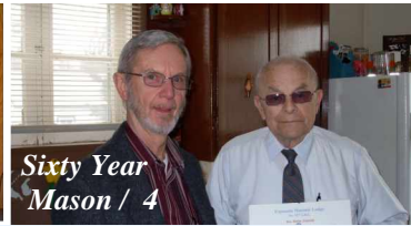
Sixty Year Mason / 4