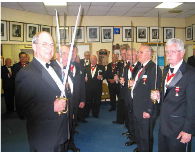
Waiting to receive the dignitaries