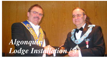
Algonquin Lodge Installation / 3