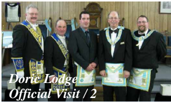
Doric Lodge Official Visit / 2