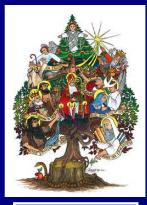
Return to Pg. 1