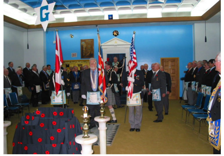
Brethren rise to form an Honour Guard and receive our Veterans