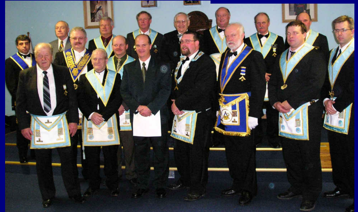
Gore Bay Lodge No. 472 Officers & Brethren gather for a photo with the District Deputy Grand Master.