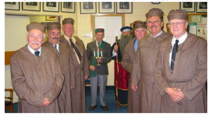
The Council assembles for a matter of utmost importance.