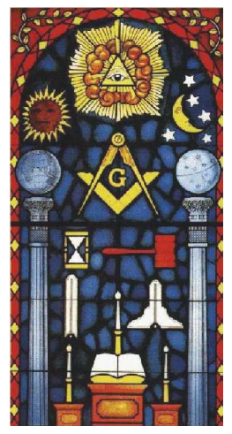
Return to Pg. 1