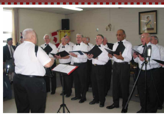
Before lunch was served the members of the Sudbury-Manitoulin District Choir performed a number of Scottish songs to the delight of everyone in attendance.

But we hae meat, and we can eat, Sae let the Lord be thankit."