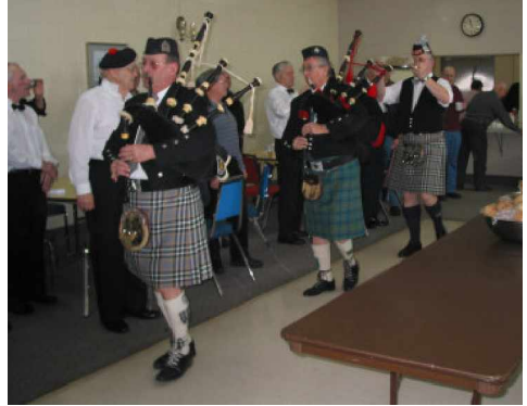
Carried by the cook and lead by the Pipers