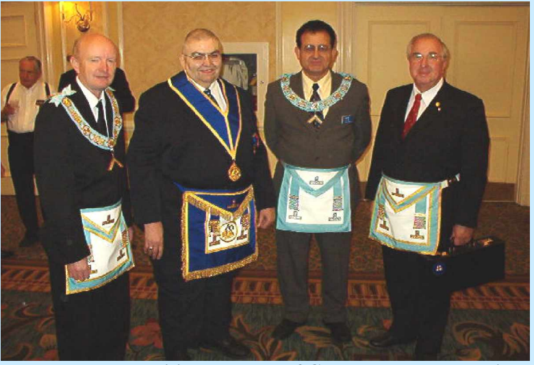
Brethren awaiting the start of Grand Lodge proceedings