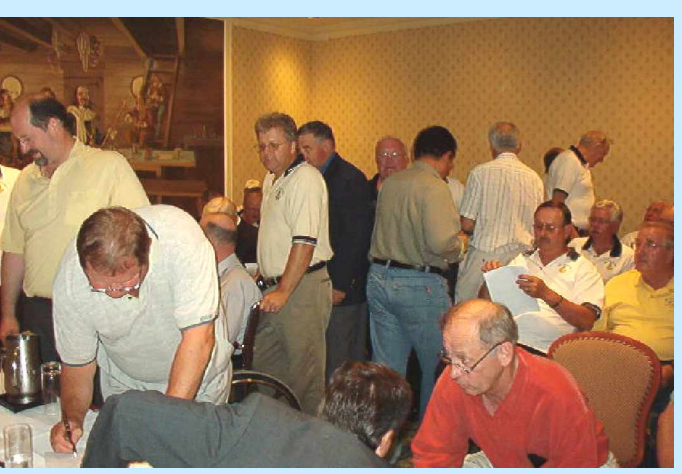
Signing the Register