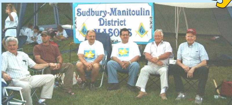
Brethren from the District and their Ladies participated in the Canadian Cancer Society Relay For Life in June.