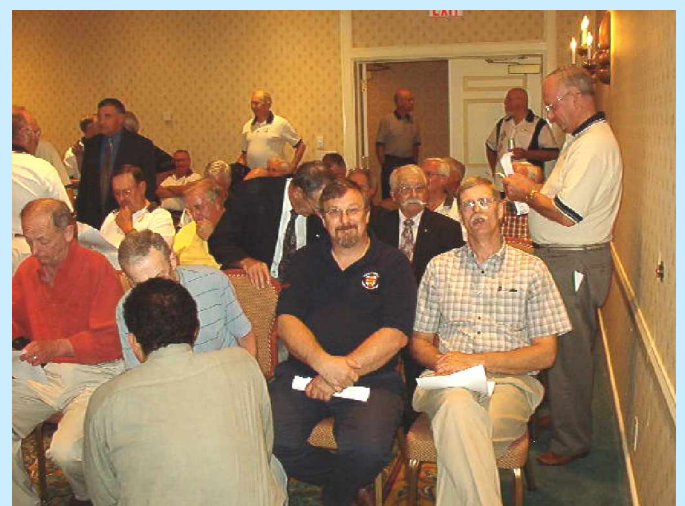
Brethren prepare for the start of the District Meeting