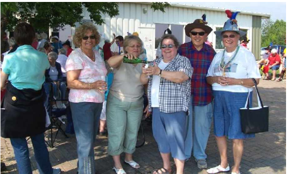
The annual Pig Roast is the perfect time for the Shrine Hillbillies to come out and have a little fun.