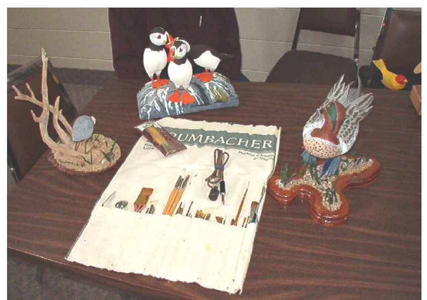
The Working Tools and Finely Crafted Art from the hands of an Expert Carver