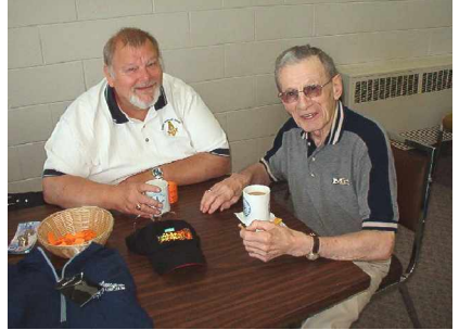
COME FOR COFFEE – STAY FOR LUNCH