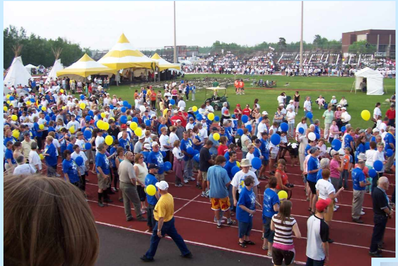
500 Cancer survivors in blue shirts gather for the Survivors Lap