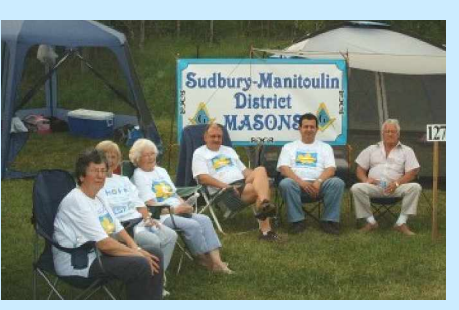
Brethren and their Ladies participated in the night all Helping event. to raise money for cancer research and patient services.

The Relay For Life is an all night event that begins with a Survivors Lap and at sundown a Luminary ceremony takes place. It brings the community together to celebrate the lives of those cancer patients who lost their fight to the disease and to applaud cancer patients who are living with cancer and those who have beaten the disease and are cancer survivors.