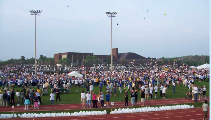
Survivors release their balloons from centre field