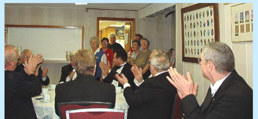
The brethren thank the ladies for an excellent meal and their warm hospitality.

Of course Doric Lodge held their annual dinner prior to the meeting which is catered by the Spanish River Chapter of the Eastern Star. The brethren enjoyed the traditional Manitoulin roast beef dinner that was extra lean and extremely tender.