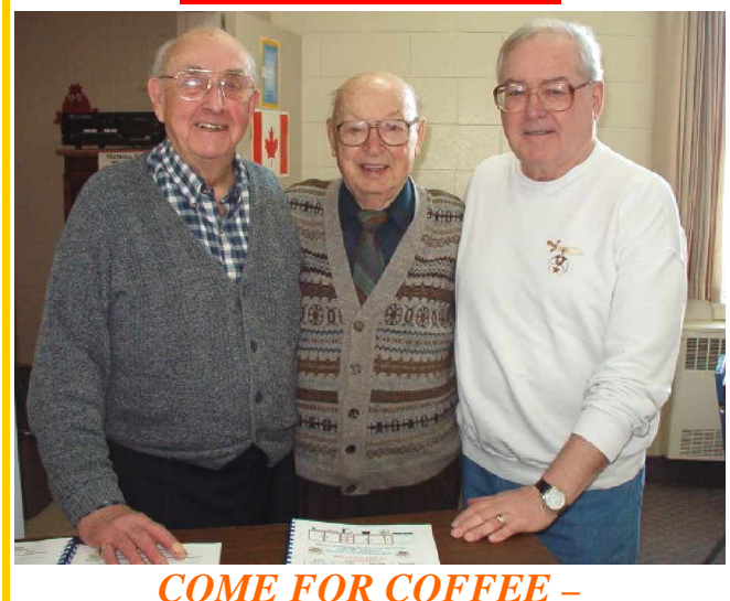
COME FOR COFFEE -STAY FOR LUNCH