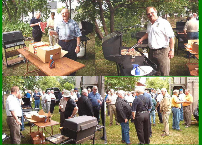
After supper stay for the Annual District Meeting and learn who is planning to run for the office of District Deputy Grand Master.

Mark June 4<sup>th</sup> on your calendar because it is again time for the Annual District Meeting and Steak Fry at Doric Lodge. Brethren will enjoy famous Manitoulin steaks grilled to perfection along with bake potatoes, vegetables and salad all for $15 a plate.