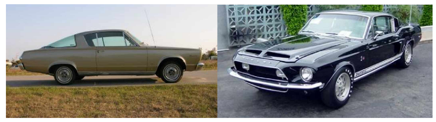
Its only a short ride to Espanola for a great day of family fun. Take the drive, enjoy a great breakfast and see some sweet cars.

For the second year Espanola Lodge No. 527 will be making and serving breakfast at the Espanola Complex in the Upstairs hall as a fundraising event for the lodge. Breakfast will be served from 8:30 am till Noon cost is $5.00 per adult and $3.00 per child