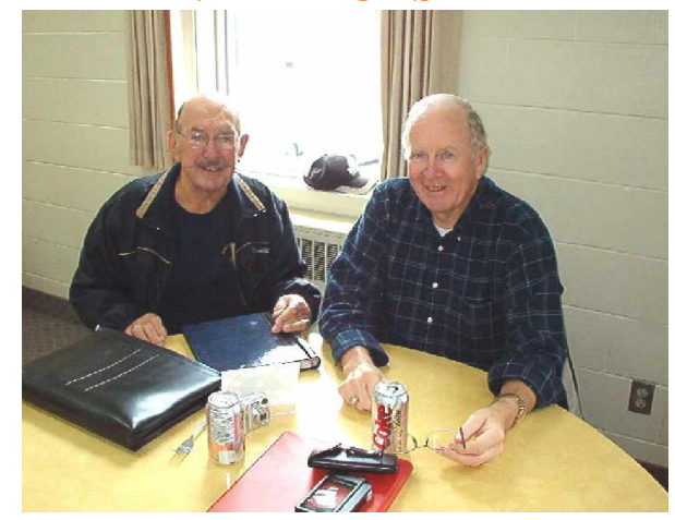
COME FOR COFFEE – STAY FOR LUNCH