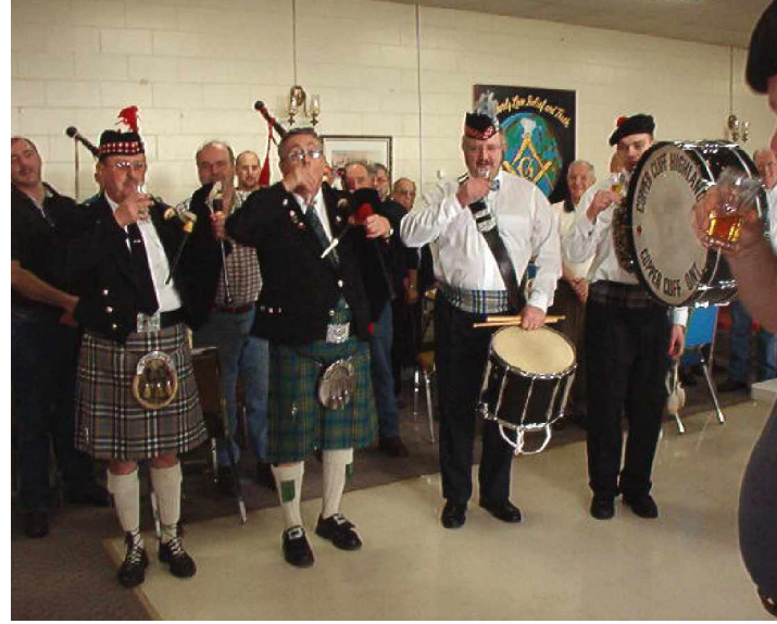
Slangavar – A Toast to the famous Bard of Scotland