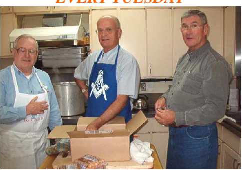
COME FOR COFFEE STAY FOR LUNCH