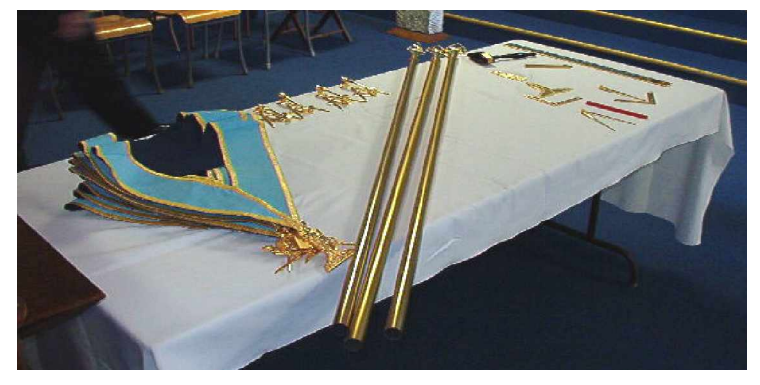
Some of the new working tools presented to Gore Bay Lodge. The Grand Master was impressed that so many Brethren and Lodges in the District had donated many of the items. He indicated this demonstrated how healthy Freemasonry is in the Sudbury-Manitoulin District.