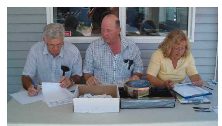
Making sure everyone starts on time