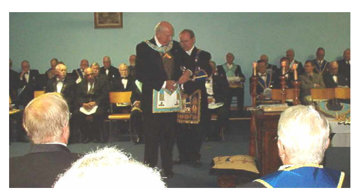
The Grand Master investing the Worshipful Master with his new regalia.