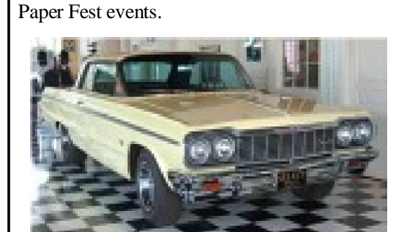
Its only a short drive to Espanola for a great day of family fun.

The Espanola Paper Fest will be held on Saturday May 27th 2006 at the Espanola Complex. Espanola Lodge No. 527 will be making and serving breakfast in Espanola the Complex upstairs hall as a fundraiser for the lodge. Breakfast is from 8:30 am till Noon cost is $5.00 per adult and $3.00 per child. After breakfast, you can enjoy the Knight Cruisers Car Club show and many other