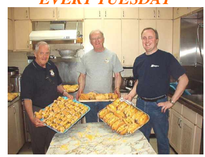
COME FOR COFFEE – STAY FOR LUNCH