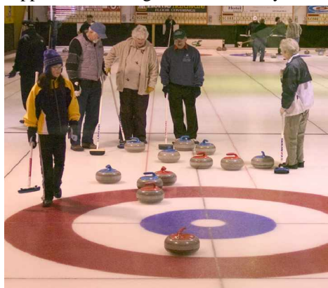
Contemplating the next shot!

February 18 th 2006 is rapidly approaching and time for the annual Espanola Lodge Curling Funspiel in support of their High School Bursary fund.